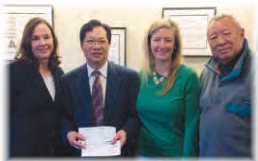
Union Mutual partnered with our Agency Council members to contribute donations to causes important to both organizations. Above, representatives from Union Mutual and Richard Soo Hoo Insurance present a check to the Kwong Kow Chinese School in Boston, Mass.

Union Mutual gives back to our communities by supporting numerous non-profit organizations in all six New England states and New York through volunteer hours and monetary donations. Union Mutual allocates charitable funds through an employee-run committee, CEO giving and a matching gift program. Employees also contribute through a Casual for a Cause program that benefits a designated charity each month. In 2015, Union employees donated nearly $15,000 to organizations that included animal shelters, food shelves, the American Cancer Society's Relay for Life, a toy drive and school supplies for local students.