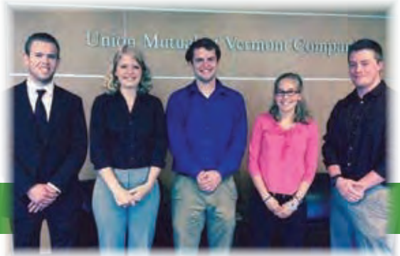
Union Mutual's 2015 summer interns