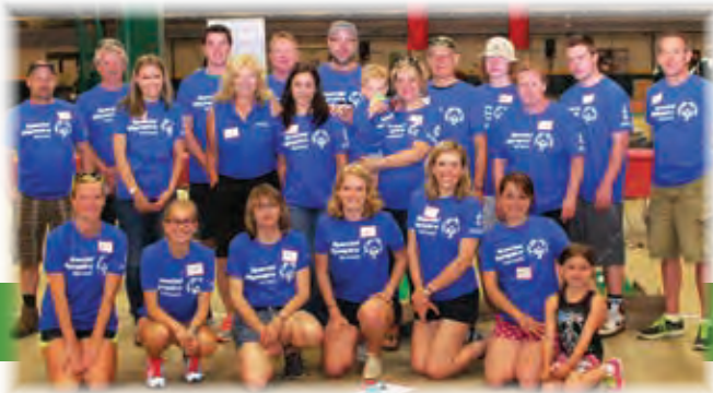
Union Mutual employees and their families volunteered at Olympic Town during the Special Olympics Vermont Summer Games.