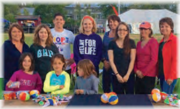
Union Mutual employees and their families volunteered at the 2015 Relay for Life at Spaulding High School in June.