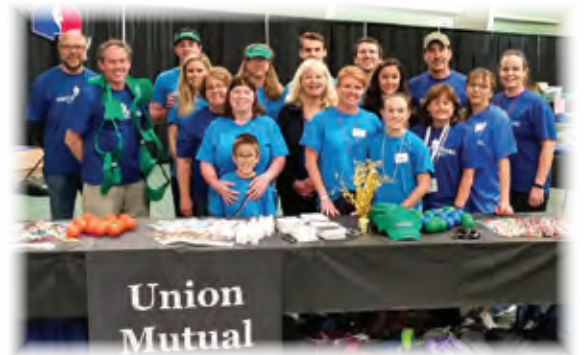
Union Mutual employees and their families volunteered for a fourth year at the Special Olympics Vermont Summer Games.