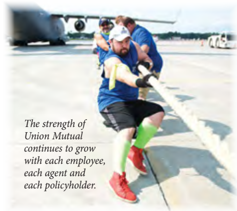
The strength of Union Mutual continues to grow with each employee, each agent and each policyholder.

- Nathan Magne Development Program’s First Graduate