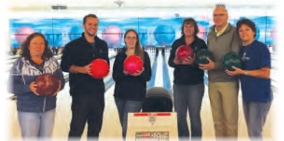
The winning Step Up Challenge team, the Super Bowlers, enjoyed an afternoon of bowling after becoming the first team of employees to walk 1,000 miles.