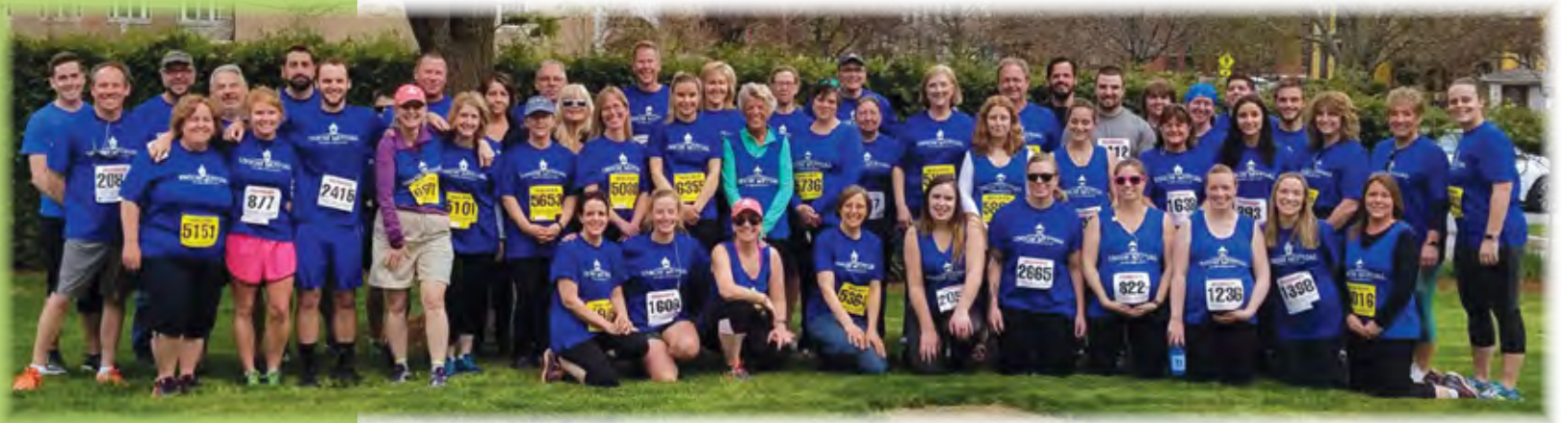
Union Mutual had a record number of participants in the 2017 Corporate Cup and State Agency Race in Montpelier in May.