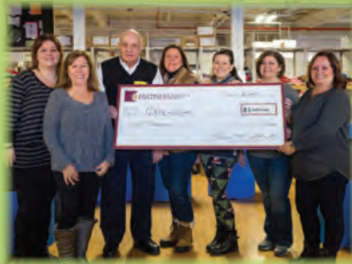
Representatives from Union Mutual independent agency Partners Insurance Group present a donation to Gifts to Give of Acushnet, MA as part of the Union Mutual Marketing Department's annual Giving Tuesday campaign.