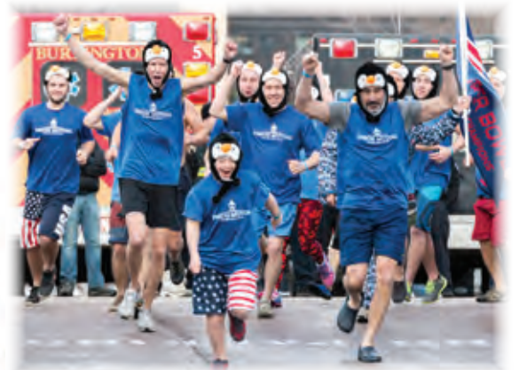
Over two dozen enthusiastic employees and special guests participated in the Penguin Plunge.