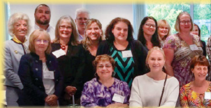
Union Mutual hosted two Customer Service Representative/Producer Training programs in 2018, providing key agency partners the opportunity to learn about Union Express, our products and Company culture, alongside Union Mutual executive management and staff.