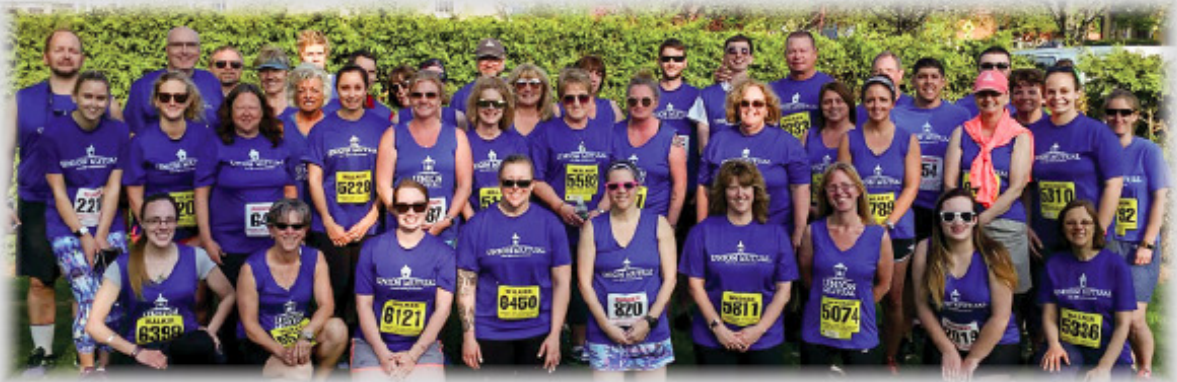
Nearly four dozen employees participated in the 2018 Corporate Cup Challenge and State Agency Race in Montpelier, part of Union Mutual's award-winning wellness initiatives.