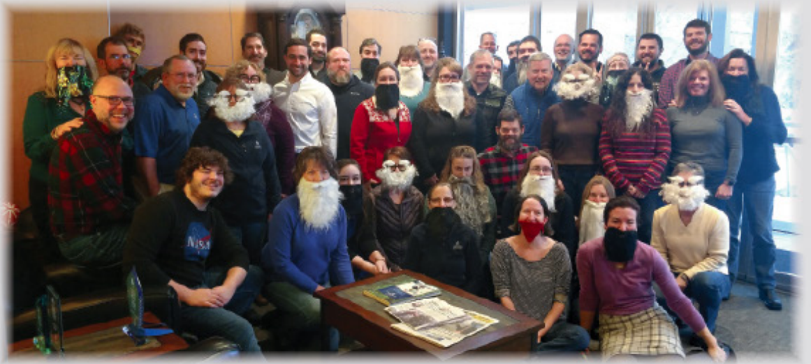
Union Mutual proudly – and creatively! – supports No-Shave November to raise awareness for cancer by growing beards and donating the money typically spent on shaving to www.no-shave.org to educate about cancer prevention and help those battling the disease. Many of Union Mutual’s male employees participated, and female employees purchased or created their own beards to show their support.