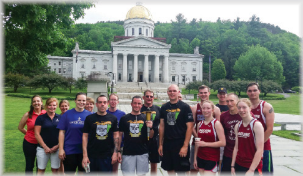
Union Mutual employees, joined by representatives of local law enforcement and the Spaulding High School cross-country team above, hosted a water station in the Law Enforcement Torch Run leading up to the Opening Ceremonies of the Special Olympics Vermont Summer Games. Union Mutual proudly serves as the lead sponsor of the Summer Games.