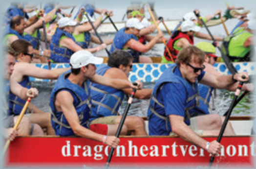
Union Mutual raised over $2,000 for Vermont cancer-related charities as part of the 2018 Dragon Boat Festival – and earned a silver medal in the event!