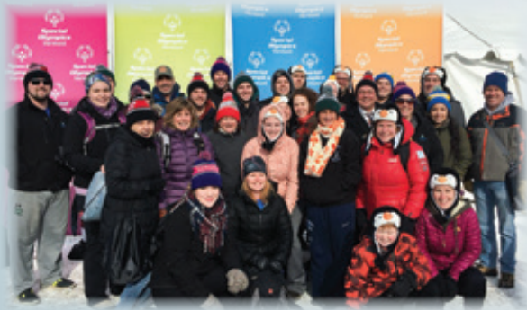
The “Union Mutual Popsicles” set a new team-best and raised over $21,000 for Special Olympics Vermont in the 2018 Penguin Plunge.