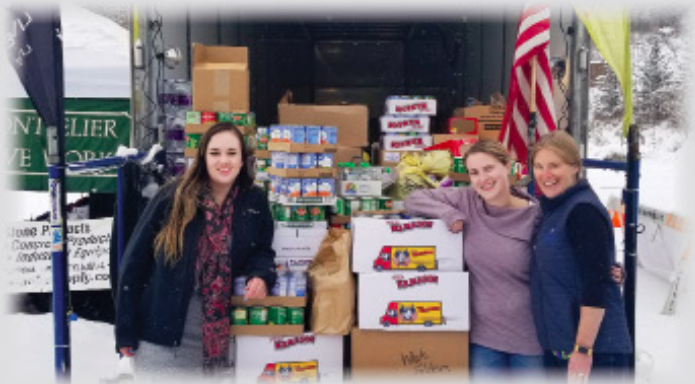
Employees competed in an inspiring Can-Struction food drive in November to benefit the Salvation Army's Emergency Food Shelf Stuff-a-Truck campaign, donating nearly 1,000 pounds of non-perishable food items.